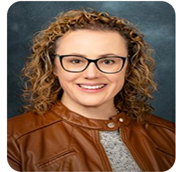
Senator Erin Grall Vero Beach, FL