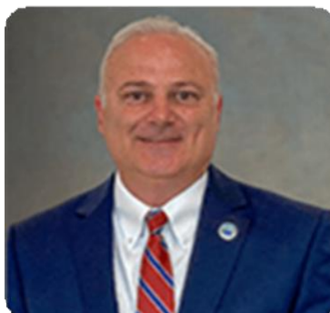
Commissioner Mel Ponder Destin, FL