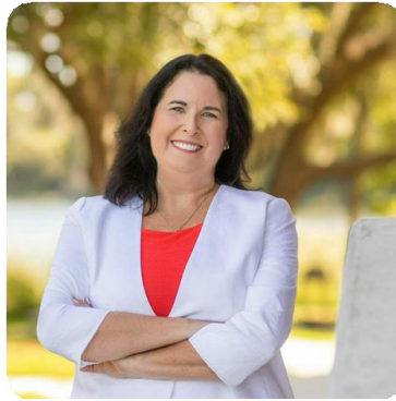
Senator Kelli Stargel Lakeland, FL