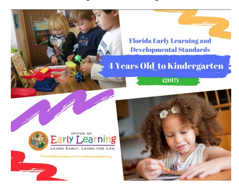
Florida Early Learning and Developmental Standards for Four Years Old to Kindergarten (2017)

An Educator's Guide to Understanding THE FLORIDA EARLY LEARNING AND DEVELOPMENTAL STANDARDS: 4 YEARS OLD TO KINDERGARTEN