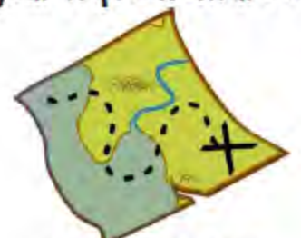
January 27-31, 2020 Jewett School of the Arts