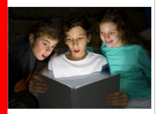
Comprehension Instructional Sequence (CIS)