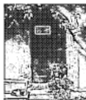
Resisters shut the door.

A second form of resistance, covert resistance, is more subtle. Some covert resisters demonstrate strong