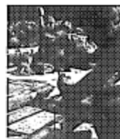
Renovators rip up floors.

intrinsically motivated to find better, more effective ways to reach and teach their students, are knowledgeable about the discipline they teach, and are willing to consider alternative teaching practices. They are reflective about their beliefs and view the change process as a complex and multifaceted journey — not a destination in itself.