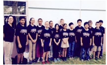
BVS Math Club