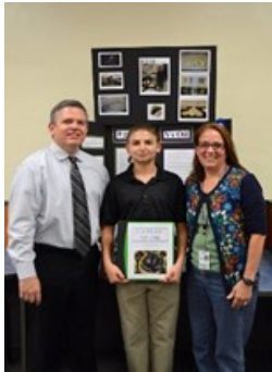
Science Fair Winner

BVS has a growing full-time population that has been recognized nationally for their