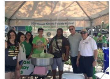
Key Club at St. Patrick's Day Parade