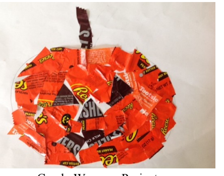
Candy Wrapper Project Designed by student in the Art Class

For more information call 407-513-3604 or email us at : <u>elementaryhome@flvs.net</u>, and we'll follow up with all the information you will need to join the fun and great learning experience. Students may sign up for courses individually or for all of the courses.