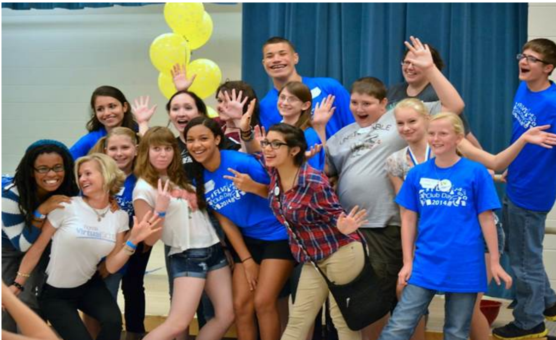
FLVS Student Ambassadors and Fine Arts at Club Day.