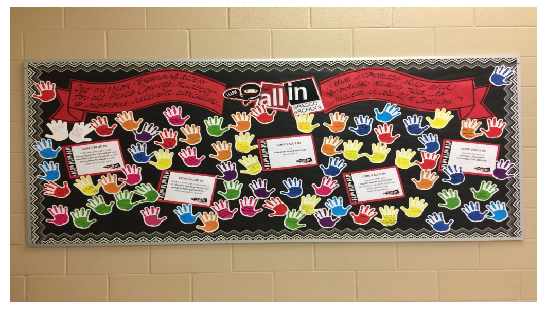
We added our hands and goals to our "All In" vision board: