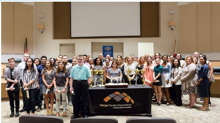
OCVS senior honorees, administration, and faculty at the 2017 Awards Ceremony.