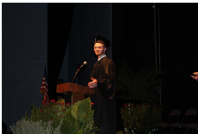
Submitted by Patrice Cover