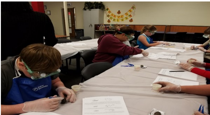
Broward Virtual School students participating in the Genetic Lab

BVS teachers put together multiple activities throughout the year to engage students in opportunities to interact with their teachers and peers. The Language Arts and Math teachers organized monthly workshops to allow students to receive face-to-face support in the areas of writing and math skills. The Science department hosted lab days where students collaborated and brought science to life.