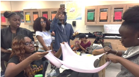
Chemistry Lab at Coconut Creek High