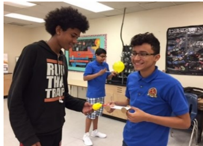
Physical Science Lab at Coconut Creek High