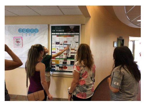
Submitted by: Diana Furey