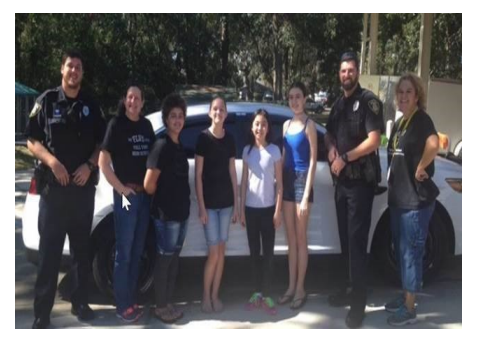
FLVS Full-Time high school students toured colleges across the state for College Visit Week. Here are a few photos of the students visiting USF St. Petersburg, Florida Atlantic University, and Saint Leo University!