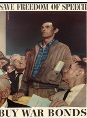
"Freedom of Speech" Norman Rockwell, 1943