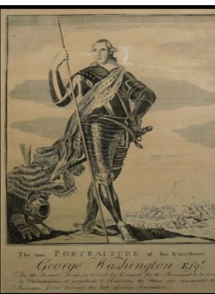
"The True Portraiture of His Excellency George Washington Esqr. in the Roman Dress, as Ordered by Congress for the Monument to Be Erected in Philadelphia, to Perpetuate to Posterity the Man Who Commanded the American Forces Through the Late Glorious Revolution." 1775