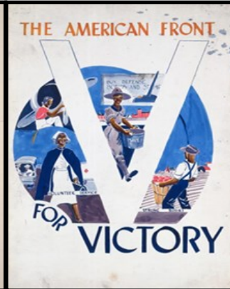
"The American Front for Victory" 1940