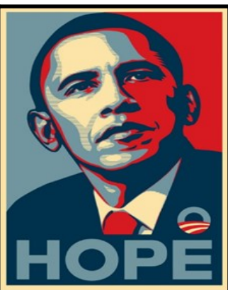
"Hope" Shepard Fairey, 2008

Once you match a pair, share your answers to the questions below with your group members: