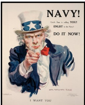
Navy! Uncle Sam is Calling YOU! Enlist in the Navy! Do it Now!" James Montgomery Flagg, 1917