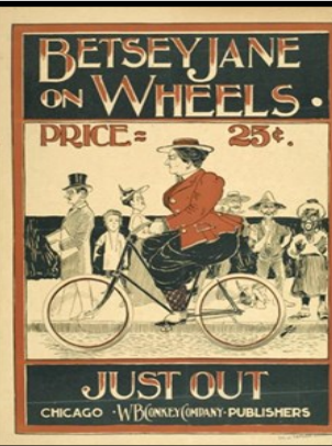
"Betsy Jane on Wheels" 1895