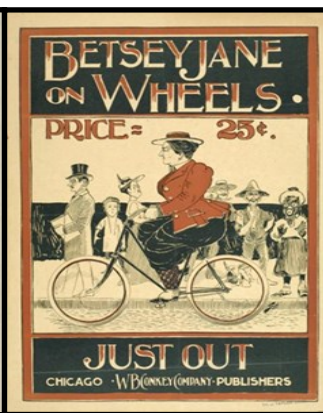
"Betsy Jane on Wheels" 1895