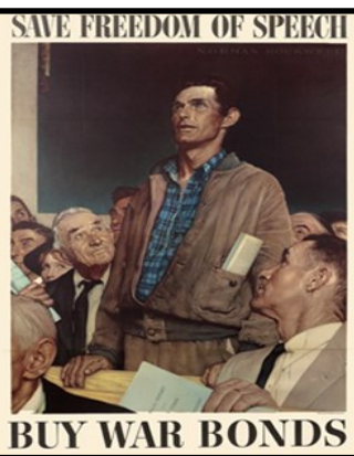
"Freedom of Speech" Norman Rockwell, 1943