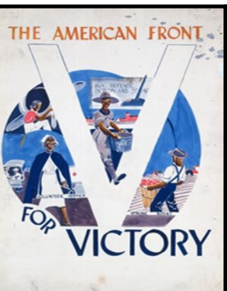
"The American Front for Victory" 1940