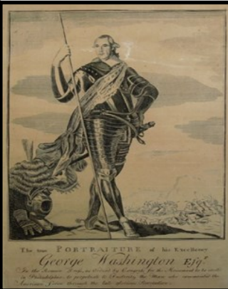
"The True Portraiture of His Excellency George Washington Esqr. in the Roman Dress, as Ordered by Congress for the Monument to Be Erected in Philadelphia, to Perpetuate to Posterity the Man Who Commanded the American Forces Through the Late Glorious Revolution." 1775