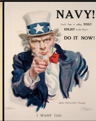
Navy! Uncle Sam is Calling YOU! Enlist in the Navy! Do it Now!" James Montgomery Flagg, 1917